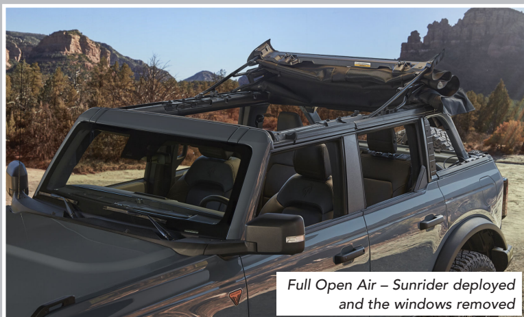
Full Open Air – Sunrider deployed and the windows removed