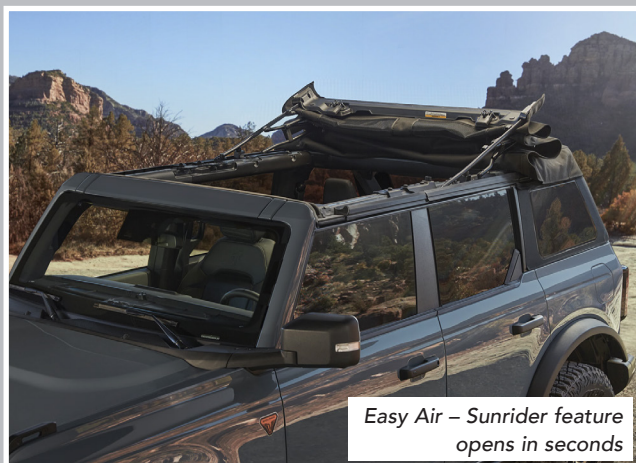
Easy Air – Sunrider feature opens in seconds