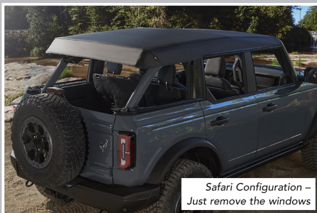
Safari Configuration – Just remove the windows