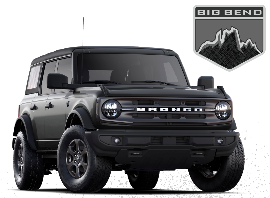
Price includes Destination & Delivery.

Terrain Management SystemTM with G.O.A.T. Modes – Normal, ECO< Sport, Slippery, Mud/Ruts and Sand</li>