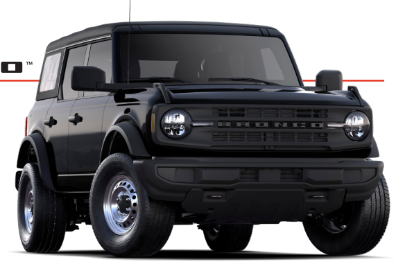
Price includes Destination & Delivery.