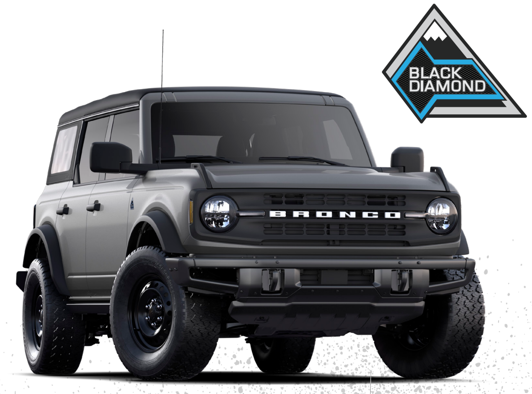
Price includes Destination & Delivery.