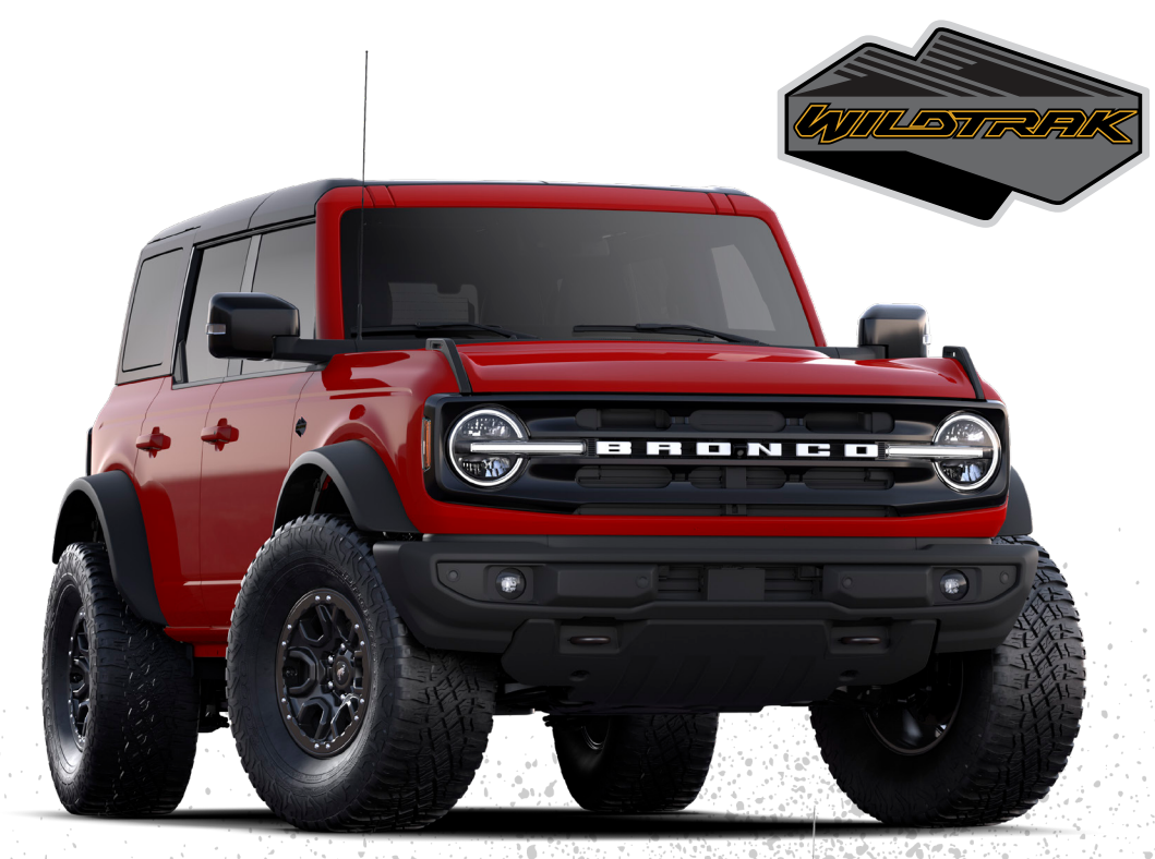
Price includes Destination & Delivery. Modular Painted Hard Top Roof Late Availability.