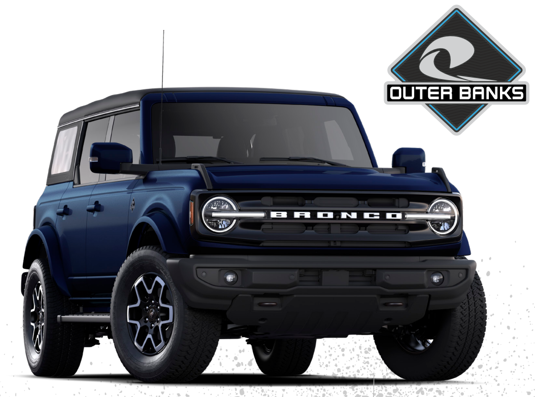
Price includes Destination & Delivery.