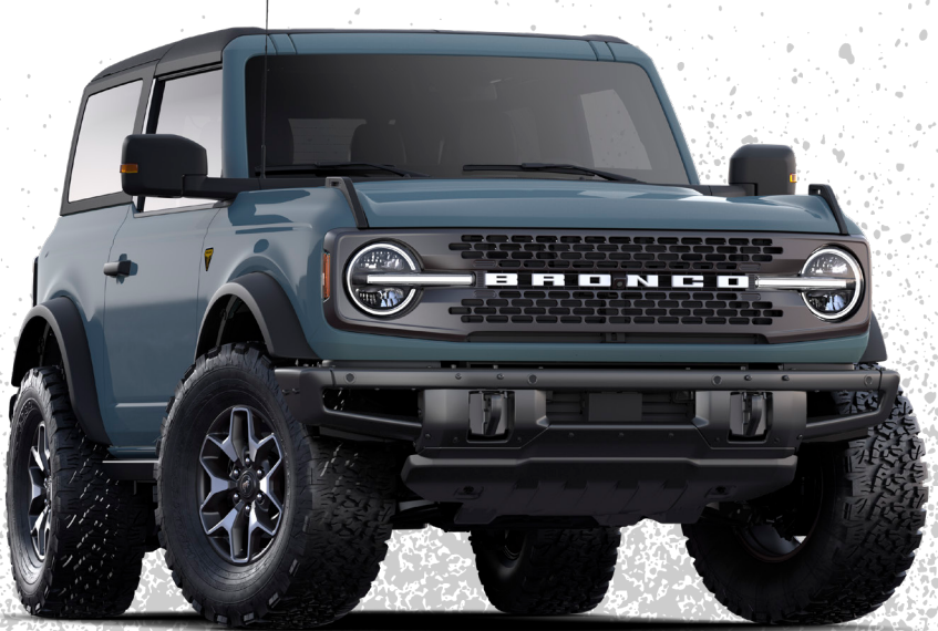
Price includes Destination & Delivery.